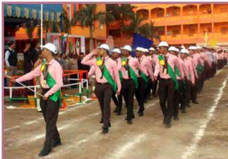
REPUBLIC DAY PARADE