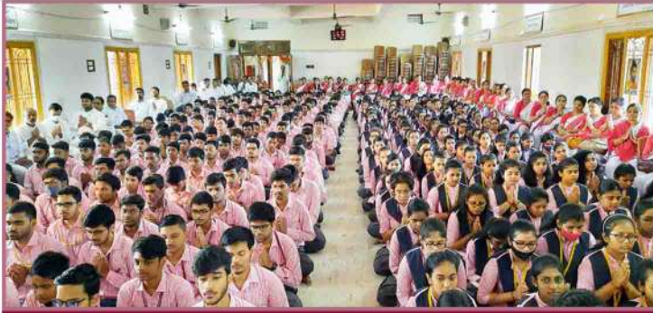
REGULAR PRAYER ASSEMBLY