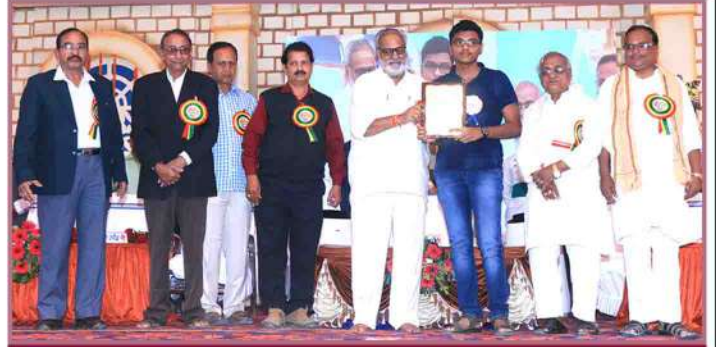
HON'BLE GOVERNOR OF ODISHA AT ANNUAL FUNCTION